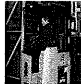
Jamie Korf moves a pallet of food at the Kansas Food Bank in preparation for Thanksgiving pick ups.

Nonprofit organizations continue to be resilient.